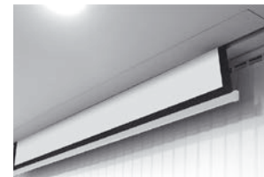
Ideal for ceiling or wall mounting