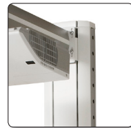
The adjustment plate allows the bar to be adjusted upward or downward by 12.5 mm.